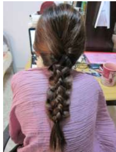
Basic Stacked Braid