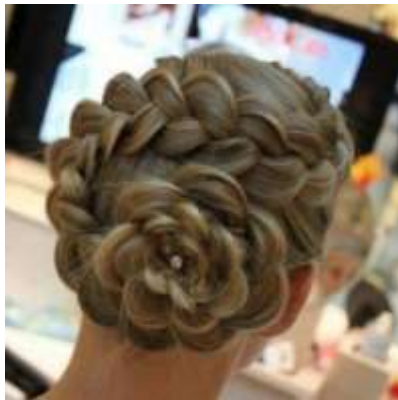
French Braid Flower