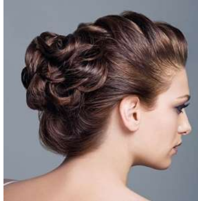
Basic French Braid Updo